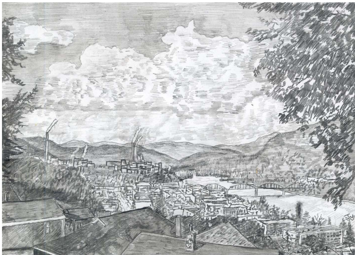
Trail, BC, Pencil on Paper, 24.5cm x 17.5cm, 2016