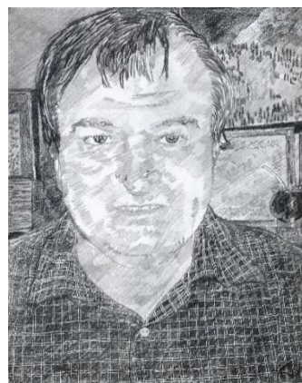
Self Portrait, Pencil on Paper 20cm x 24.9cm, 2015