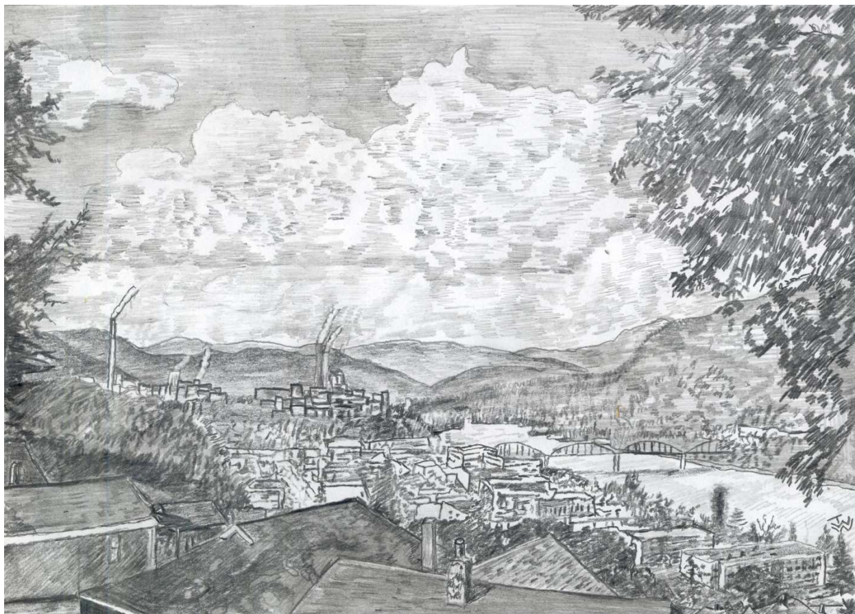
Trail, BC, Pencil on Paper, 24.5cm x 17.5cm, 2016