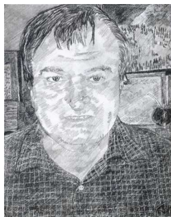
Self Portrait, Pencil on Paper 25cm x 20cm, 2015