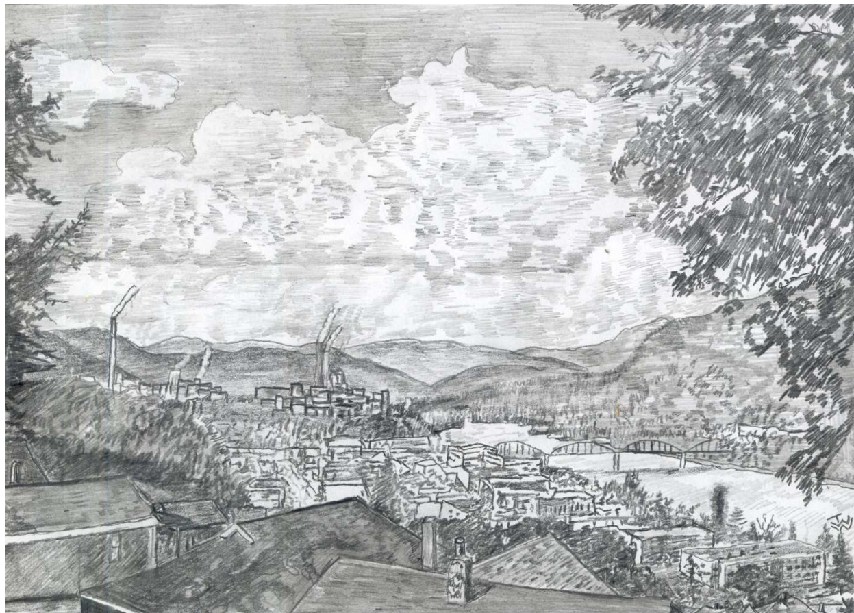
Trail, BC, Pencil on Paper, 24.5cm x 17.5cm, 2016