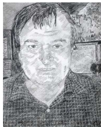
Self Portrait, Pencil on Paper 20cm x 24.9cm, 2015